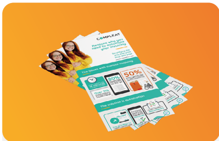
Accounts Payable Automation Infographic