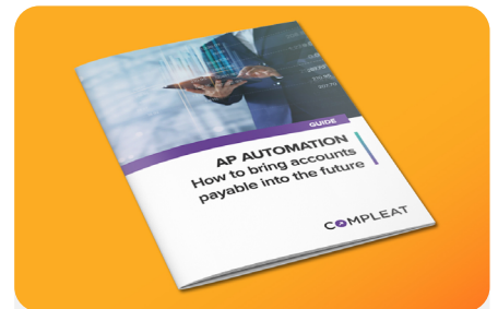
AP Automation - How to bring accounts payable into the future